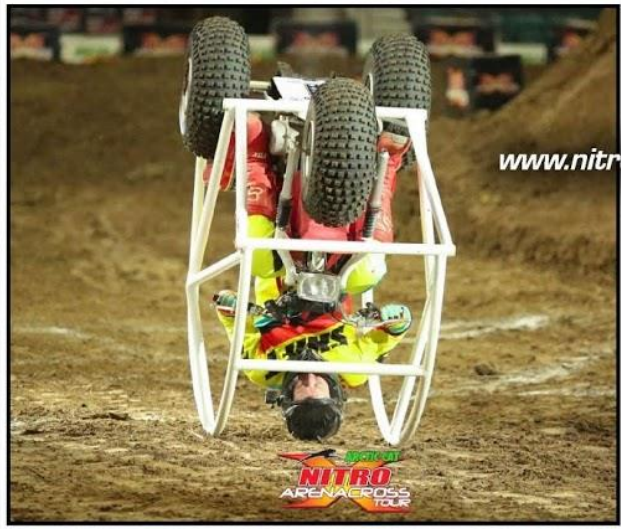
FRONT ROLL 3-WHEELER 3 TIMES IN 100FT - NON STOP

TURN AROUND AND RIDE BACKWARDS AND BACK FORWARDS IN 100FT - NON STOP